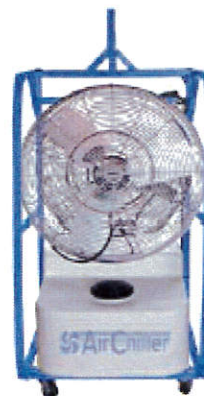
IND-30 15,000 CFM