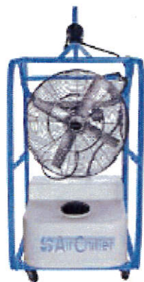
IND-24 12,500 CFM