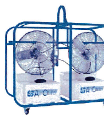
IND-24D 14,000 CFM